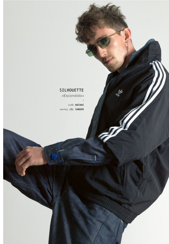
SILHOUETTE »Escondido« - outfit ADIDAS earring JIL SANDER